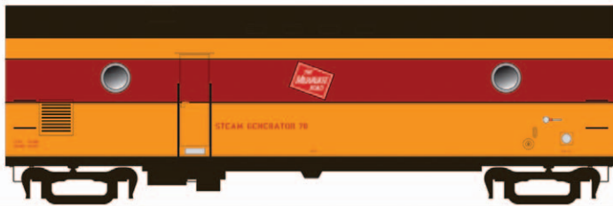
Milwaukee Road (1950 scheme) – 107168-171 (4 numbers)