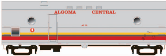
Algoma Central (silver) – 107160-163 (4 numbers)

The "Oh, So Steamy!" Steam Generator Car also features working backup lights and EVERY pipe that is underneath the prototype — we banged our heads on the real ones enough times to know. It works on DC and DCC layouts and includes beautiful, accurate BX express trucks. The Rapido Steam Genny is a must for any railroad that operated passenger trains in cold weather. Still only $59.95.