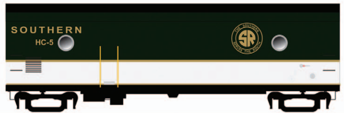
Southern Railway – 107177-180 (4 numbers)