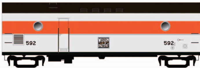
Western Pacific – 107181-184 (4 numbers)