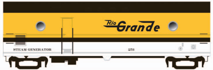
Denver & Rio Grande Western – 107164-167 (4 numbers)