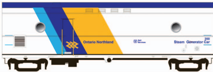
Ontario Northland – 107174-176 (3 numbers)