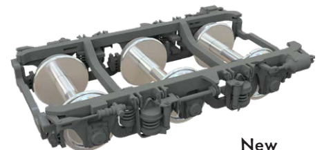
New 61-BNO trucks