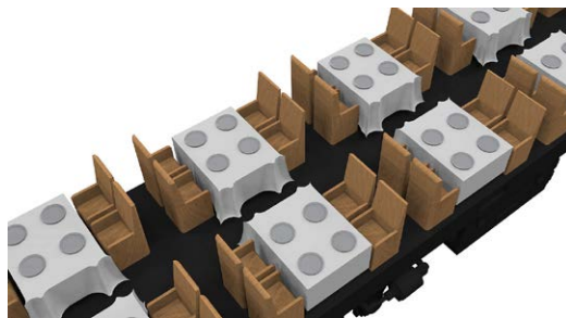
FULL interior details!